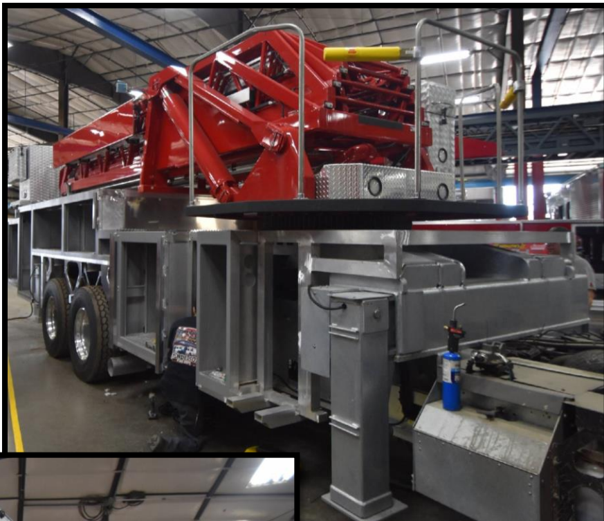
Passenger side as of 6-14-18