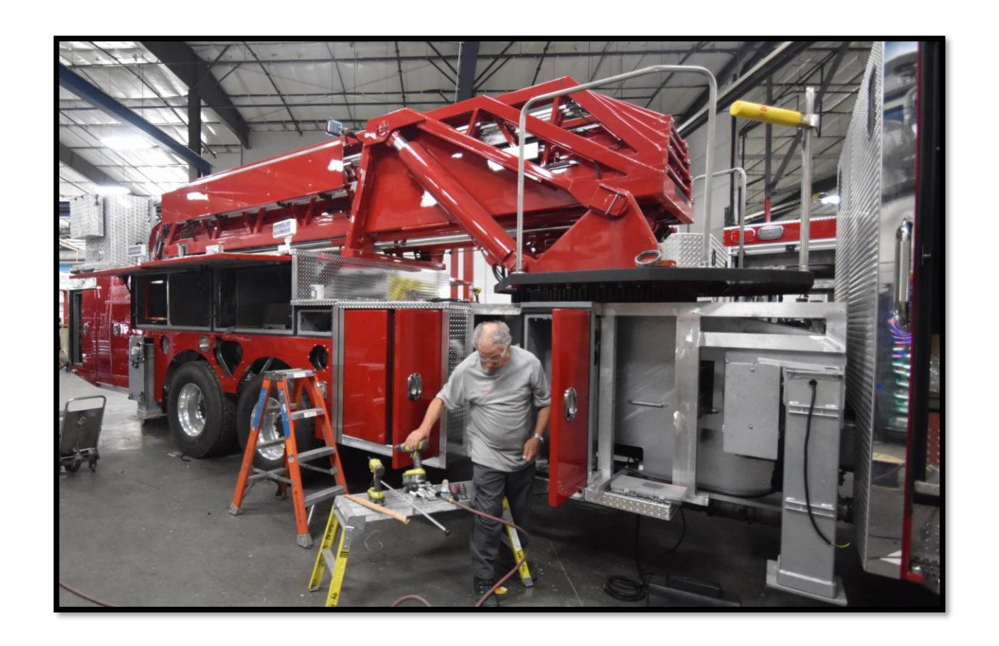
Passenger side as of 6-28-18