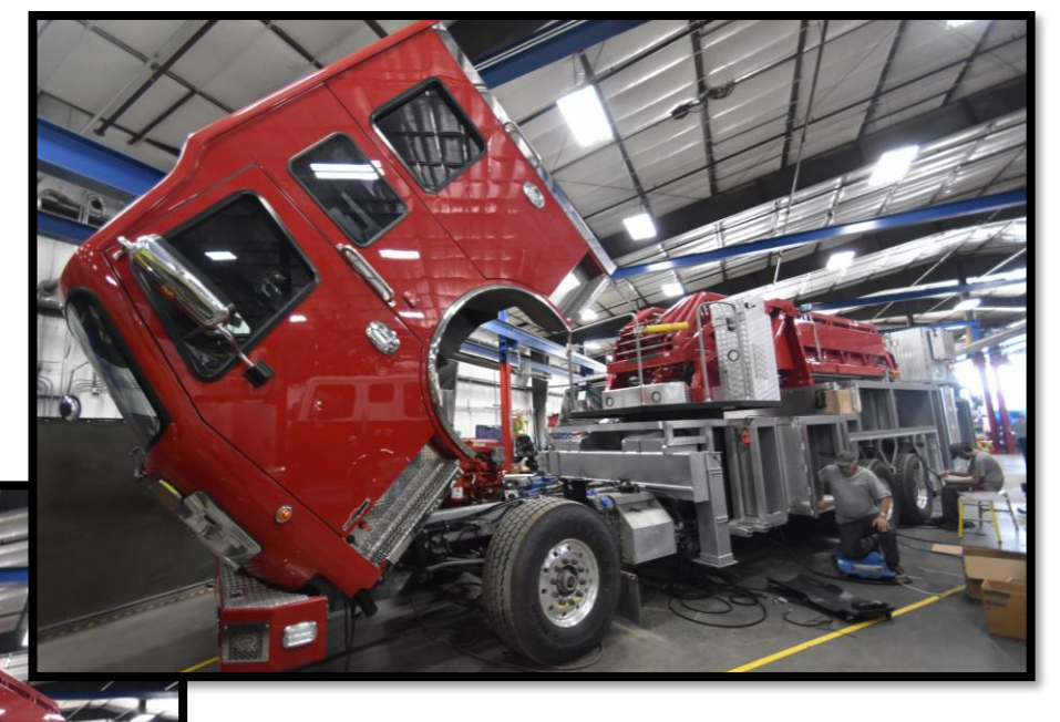
Driver Side as of 6-14-18