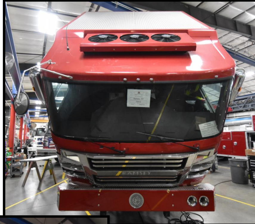
Front and Rear as of 6-14-18