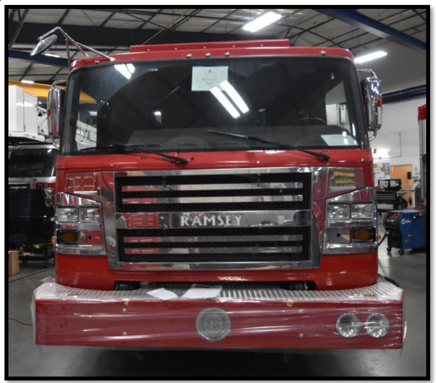
Front and Rear as of 6-22-18