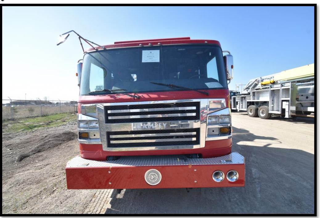
Front as of 5-3-18