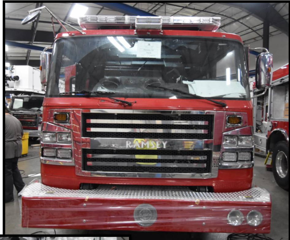
Front and Rear as of 6-28-18